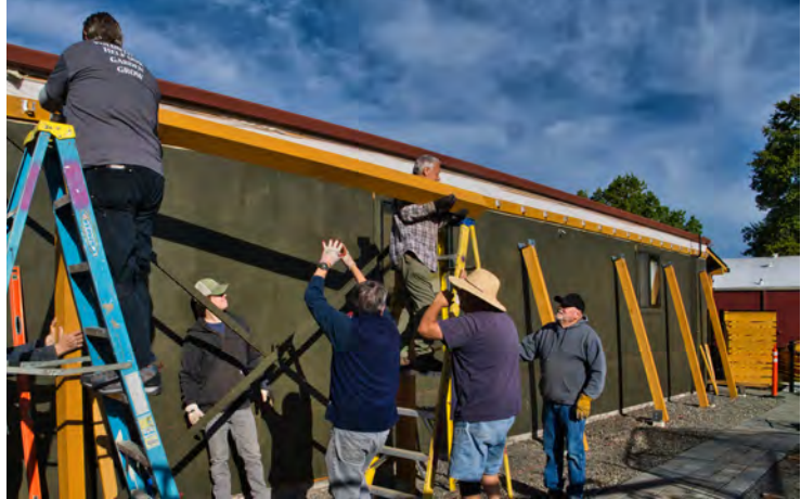
Volunteers hoisting the beam into position for the overhang.