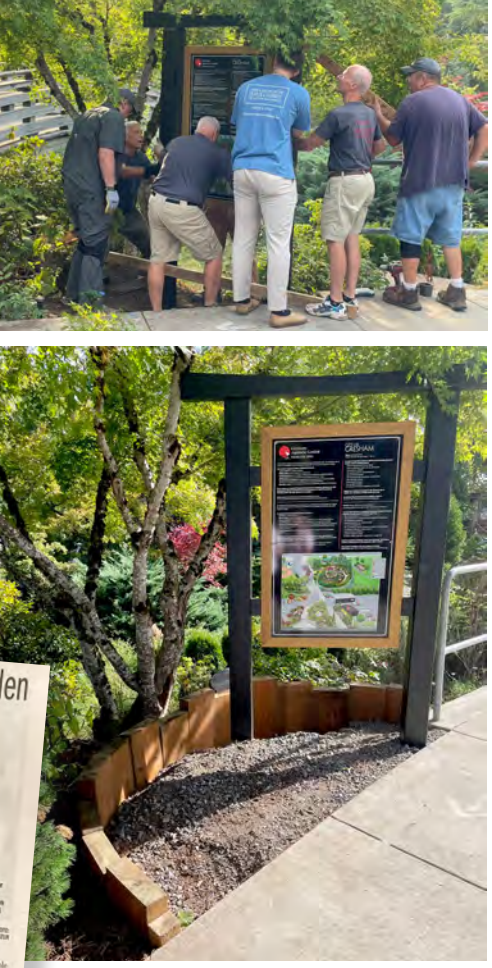
Top photo: Volunteers installing the sign. Bottom photo: Partial completion of the ground. Blue stone will be cut into place.