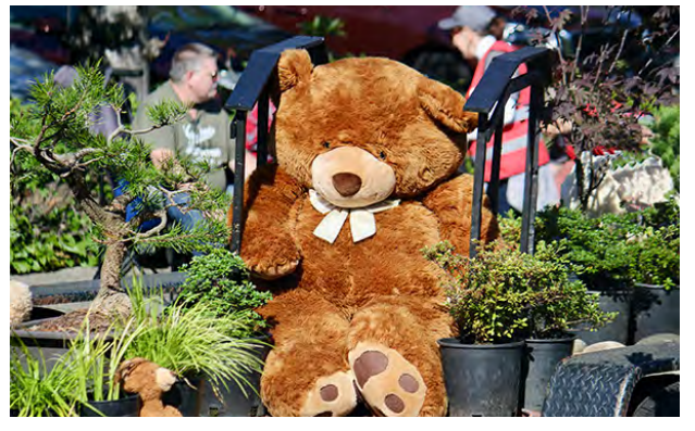
Close up view of GJG's float.